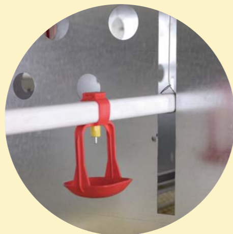
Centrally height-adjustable drinker line