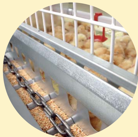
Chain feeding system with centrally adjustable feed access slots

Manure is removed automatically from all decks on polypropylene manure belts. To extend the lifetime of the manure belts Farmer Automatic has developed special manure belt rollers which support the belts. Even in very long cage rows the manure belts run as easily as if on ball bearings.