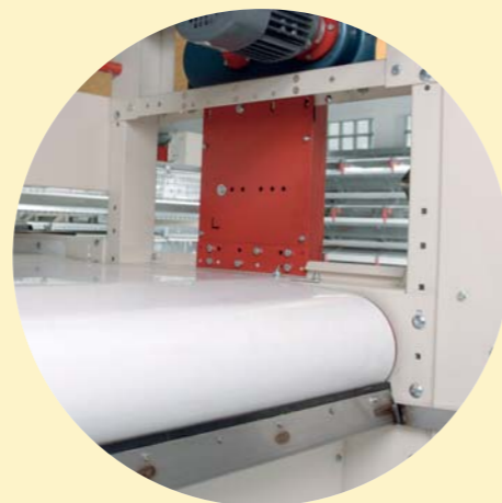
Automatic manure removal reduces ammonia and risk of infections